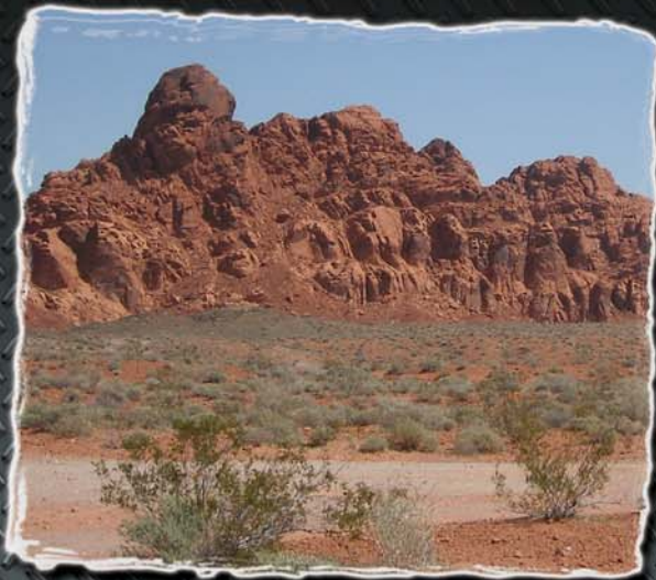
Red Rock Canyon National Conservation Area Las Vegas, NV